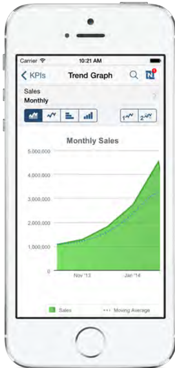
Monitor key performance indicators (KPIs) in real-time.

“WITH NETSUITE, EVERYTHING IS ‘NOW’—THE INSTANT ACCESS TO INFORMATION IS INCREDIBLE.”